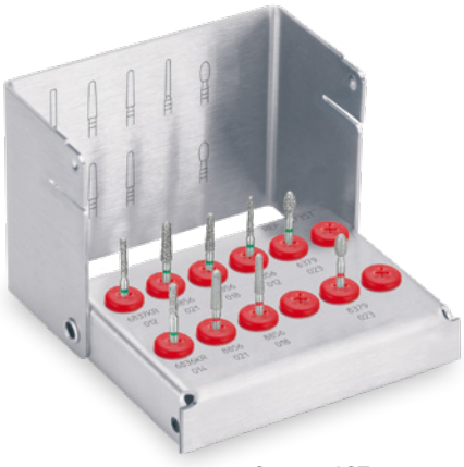
Set 4573ST In a bur block suited for sterilisation