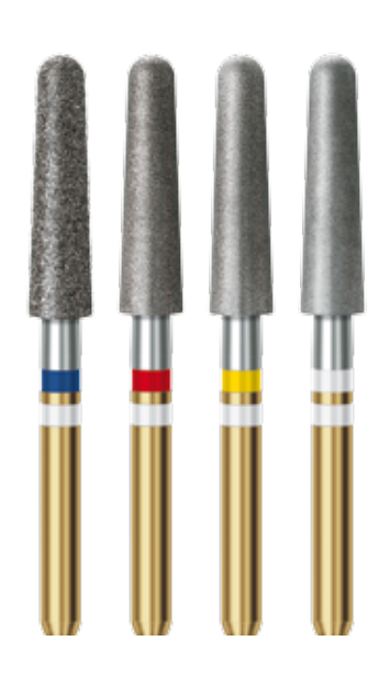
Four work steps lead to a perfect result